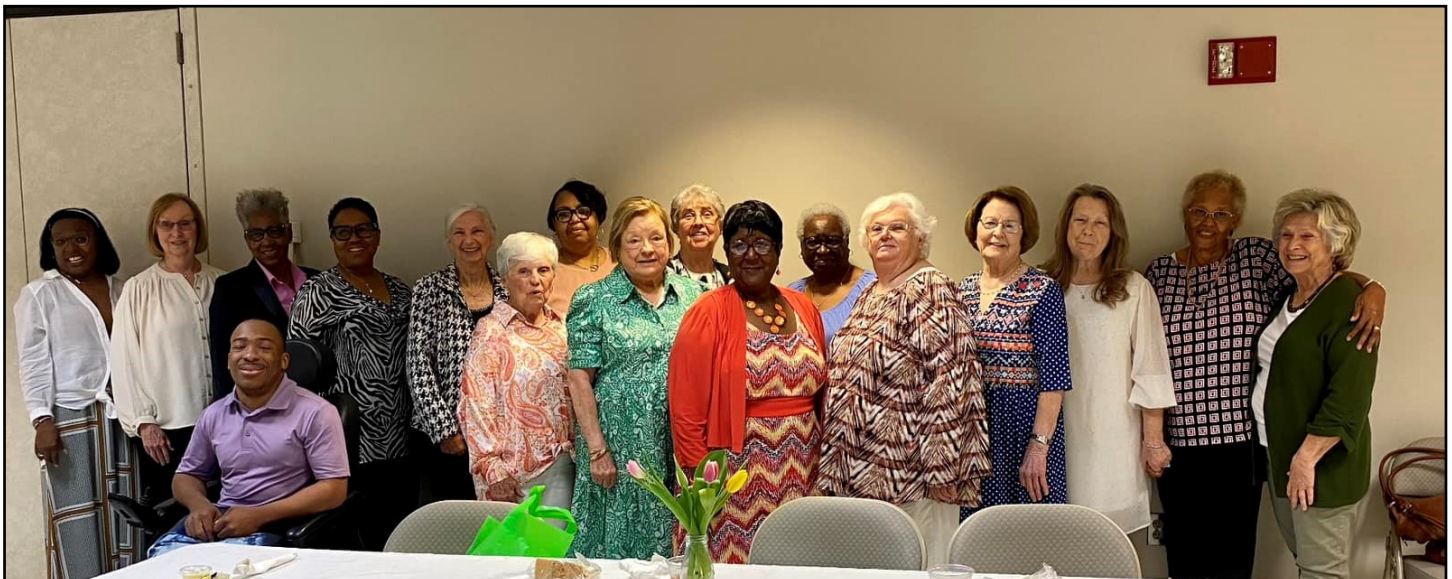
Members attending the Appreciation Dinner.