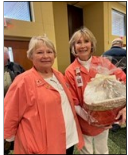
The Gift Shop at Highlands Medical Center put together a large gift basket during the auxiliary's recruiting event at Senior Health Fair.

The first Uniform Sale this year also included medical equipment, compression socks and shoes!