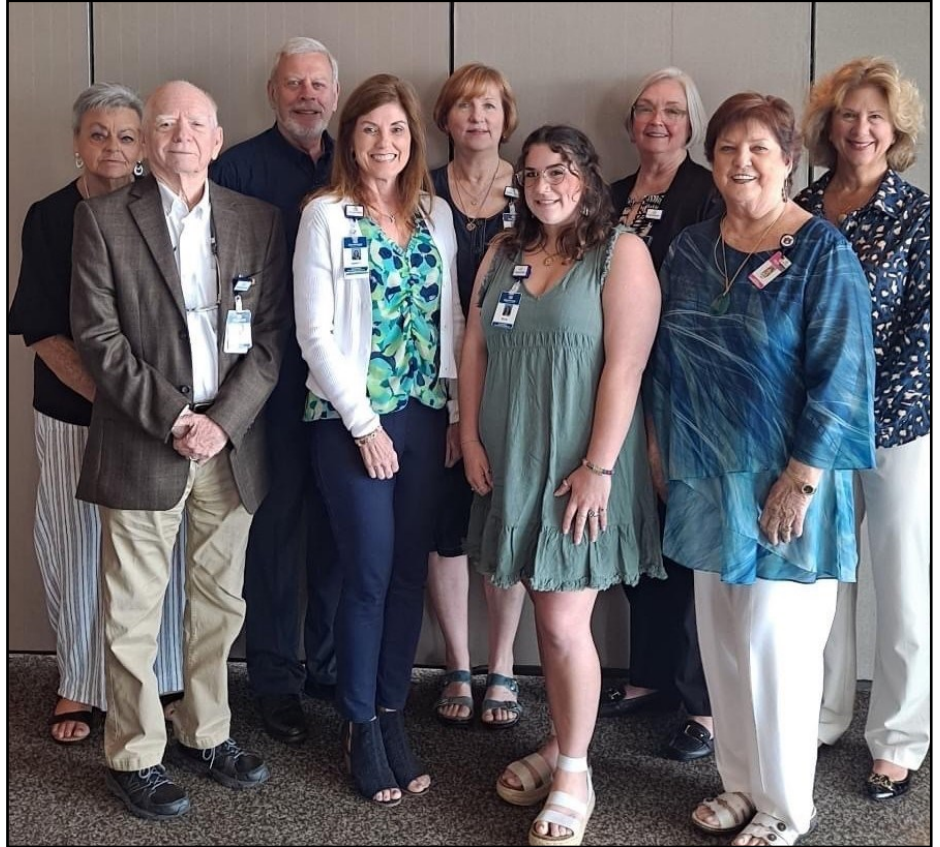
Grandview volunteers received service hours pins at the April luncheon.